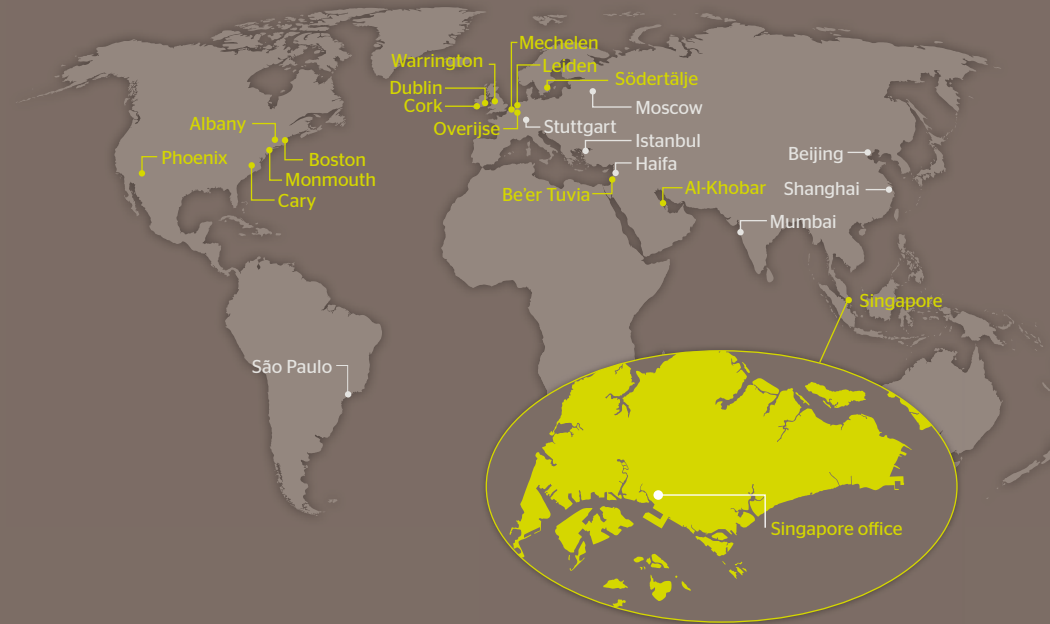
15 offices in 9 countries

Our team is ready to support you on your next project.